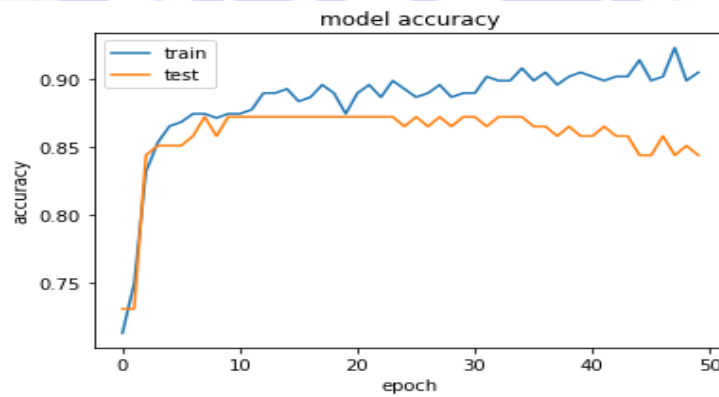
Figure 5a: Model Accuracy

Simple binary class was set up in the artificial neural network (ANN) design, which is a subset of the supervised machine learning. The experimental simulations of the artificial neural network (ANN) model showed an optimal performance at 55, 65 neurons in the middle layer with the predictive accuracy of 87.17% and standard deviation of 2.48%. This denotes that the model is expected to predict correctly at most 87% of the time with little variation of 2.48% in real-world practice, which was achieved at the 50 epochs. Figure 5a and 5b provides a snapshot of how the model's performance changes over the course of training. Figure 5a depicts the model accuracy and Figure 5b depicts the model loss where the accuracy increases and the loss decreases as the number of epochs progresses, which is generally a positive sign.