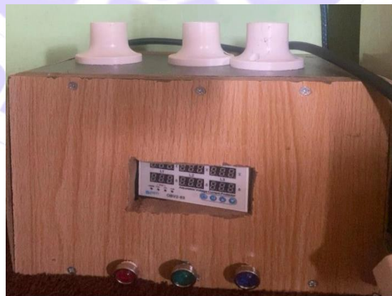
Plate 3.1: Casting and packaging

Three identical circuits were constructed—one for each of the three phases. Each circuit was built using a transformer, comparator, transistor, and relay. A step-down transformer was used to reduce the mains voltage, and the LM741 integrated circuit served as the comparator, surrounded by supporting components. The BC557 transistor functioned as a switch, while the relay used was of the electromagnetic type. The entire process was broken down into six key stages: voltage step-down, rectification, filtration, comparison, switching, and display/indication. Each phase supply (R, Y, B) was individually stepped down to the required voltage and current using separate transformers. Only one phase operates at a time. IN4007 diodes were used to convert AC to DC, and capacitors were employed to filter out voltage ripples from the DC supply. Resistors and a potentiometer were used to provide the appropriate input voltage to the comparator. Depending on the comparator's output, the BC557 transistor switched between ON and OFF states, effectively acting as a switch. All components were mounted on a circuit board and wired accordingly. A 12V DC power supply was generated, and the circuit's functionality was verified by connecting a load (a bulb) to the output, which successfully produced the expected result. The casting plate is presented in Plate 3.1.